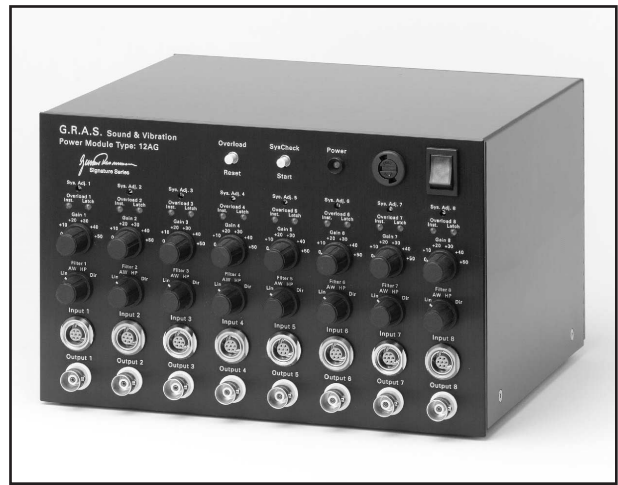
Fig. 1 8-channel Power Module Type 12AG

The input to each channel is a 7-pin LEMO socket