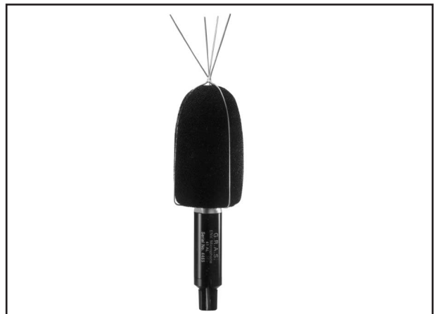
Fig. 1 Environmental Microphone Type 41AL and other applications where the microphone's reference direction points horizontally.

In order for the rain protection cap and foam windscreen to protect the microphone properly, the microphone's diaphragm must be kept horizontal. Therefore, the orientation of the Type 41AL relative to the sound source cannot be adjusted as required by many standards. However, the Type 41AL is available in versions for both 0° incidence and 90° incidence (see Fig. 2). The 0° -version is for aircraft fly-over noise measurements and other applications where the microphone's reference direction points upwards. The 90° version is for measuring community noise, traffic noise, vehicle pass-by noise etc.,