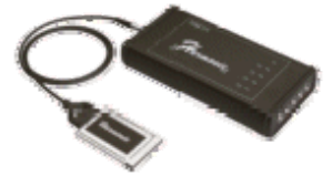
2...8 channels HARMONIE® The universal portable acoustic laboratory [more]