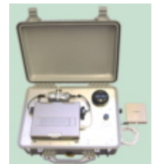
NoiseLOG mobil Mobile noise monitoring station [more]