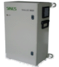
NoiseLOG Long-term monitoring of emissions and immissions [more]