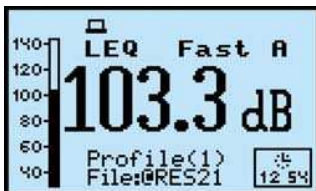
Main result in one profile view

*each function parallel to the meter mode **with USB 1.1 Host function not active and backlight off