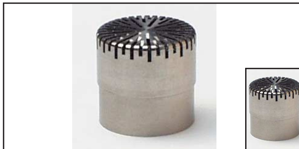
Fig. 1 1/2-inch Wide-frequency, Free-field Microphone Type 40AC (inset shows true size)

Fig. 3 shows what these are in a free-field for various angles of incidence. The Type 40AC compensates for this to provide a flat frequency response at an angle of 0° incidence in a free-field (see Fig. 2).