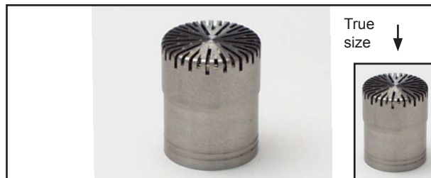
Fig. 1 1/2-inch Prepolarized Pressure Microphone Type 40AD

G.R.A.S. CCP preamplifiers (ICP®) are also available for use with the Type 40AD, these are: