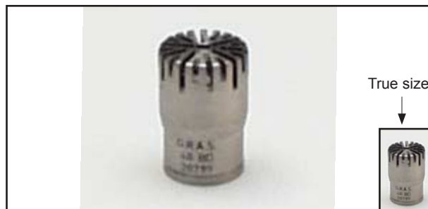
Fig. 1 1/4-inch Prepolarized, Pressure Microphone Type 40BD

In an open sound field, a pressure microphone will also include the disturbing effects of its presence in the sound field. These are minimal for most of its frequency range because of its small dimensions (see Fig. 1 inset). At higher frequencies, the effects of reflections and diffractions must be accounted for. Generally, they lead to an increase in the measured sound pressure and corrections have to be made. Fig. 3 shows what these corrections are in a free field for various angles of incidence.