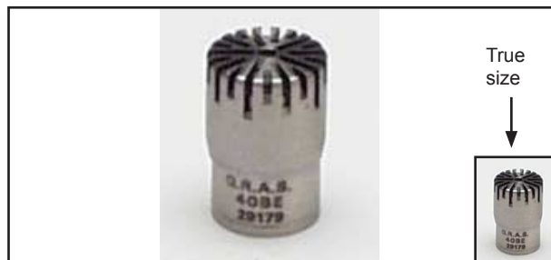
Fig. 1 1/4-inch Prepolarized Free-field Microphone Type 40BE

The disturbing effects of its presence in the sound field are minimal for most of its frequency range because of its small dimensions (see Fig. 1 inset). At higher frequencies, the effects of reflections and diffractions generally lead to an increase in the measured sound pressure levels. Fig. 3 shows what these are in a free-field for various angles of incidence. The Type 40BE compensates for this to provide a flat frequency response at an angle of 0° incidence in a free field (see Fig. 2).