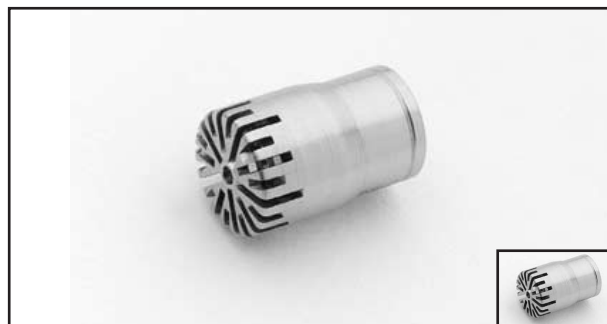
Fig. 1 1/4-inch High-pressure Microphone Type 40BH (inset shows true size)

As a pressure microphone, the Type 40BH measures the sound pressure at the location of its diaphragm. In an open sound field, a pressure microphone will also include the disturbing effects of its presence in the sound field. These are minimal for most of its frequency range because of its small dimensions (see Fig. 1 inset). At higher frequencies, the effects of reflections and diffractions must be accounted for. Generally, they lead to an increase in the measured sound pressure and corrections have to be made. Fig. 3 shows what these corrections are in a free field for various angles of incidence.