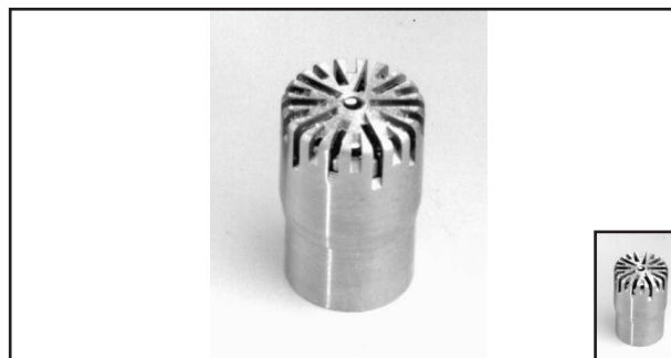
Fig. 1 1/4-inch Pressure Microphone Type 40BP (inset shows true size)

G.R.A.S. 1/4-inch preamplifiers (see data sheet for Types 26AA, 26AB, 26AC and 26AL) are also