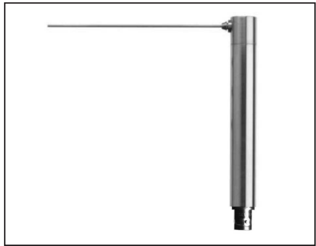
Fig. 1 CCP Probe Microphone Type 40SC

The integrated BNC socket is for drawing power from, and delivering the signal to, a constant-current power supply, e.g. the G.R.A.S. CCP Supply Type 12AL, or any other ICP® compatible power supply.